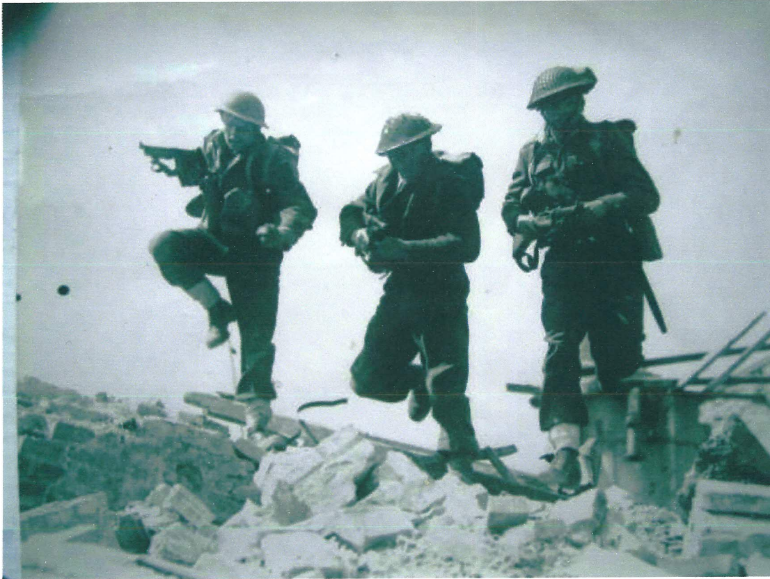
“3 charging“ Staged picture ? Who are these men ?

HMS Saunders at Kabrit (Kasferit) November 1943.